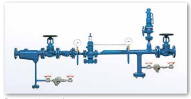
Pressure reducing valve system

Pre-assembled stations including matched products to condition the fluid prior to controlling its temperature, pressure etc., or measuring its flowrate. Includes all necessary downstream products.