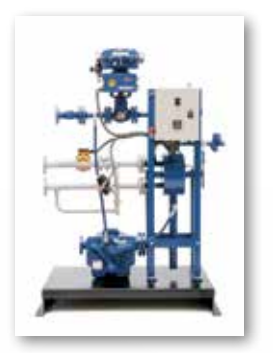
Compact standard heat transfer packages