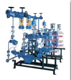
Specially designed heat transfer solutions