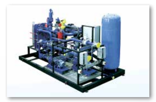
Bespoke engineered systems